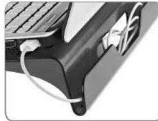
Easy Cable Management