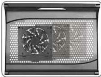
Removable Silent Fan