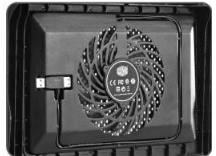
Easy Cable Management

Note: Photos may differ slightly from the final product.