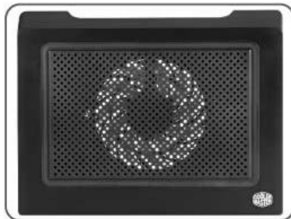
140 mm Silent Fan